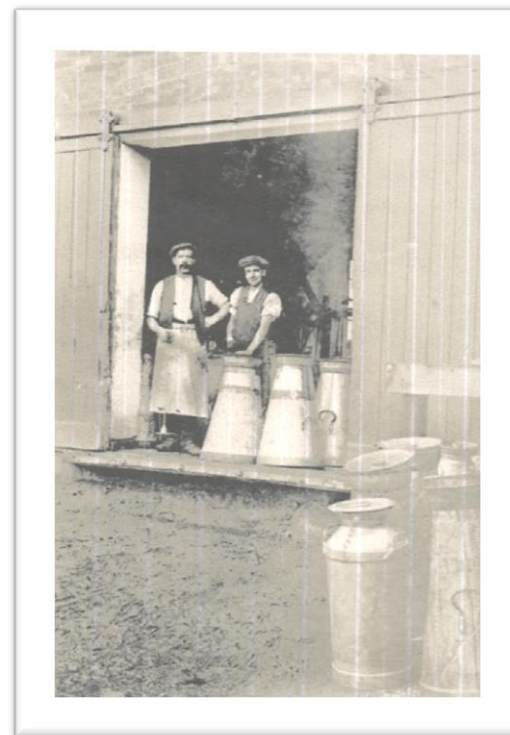
DONKEY AND OTHER STAFF AT THE MILK FACTORY

Once the collection of milk from farms changed to motor transport, the factory closed and the building stood empty for a while. Then it was decided to turn it into a much needed village hall. The conversion work was done by local builder Hursts of Awbridge and from the early 1930s it became King George's Hall. A look at the rear of the building shows clearly some of the structural changes made.