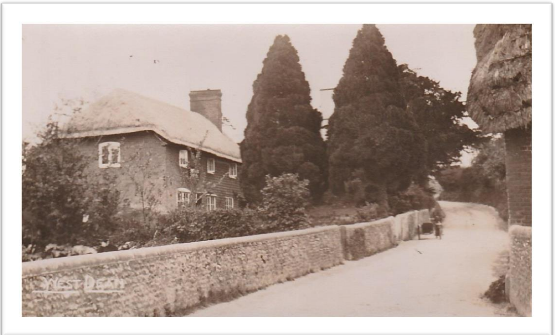
THE VILLAGE SHOP PHOTOGRAPHED IN 1931 OR EARLIER