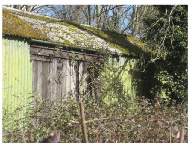
THE FORMER SILCOCKS SHED. THE LEFT PICTURE SHOWS THE DOOR FOR UNLOADING GOODS FROM THE TRAIN AND THE RIGHT ONE THE DOORS FOR COLLECTING GOODS BY CART OR LORRY