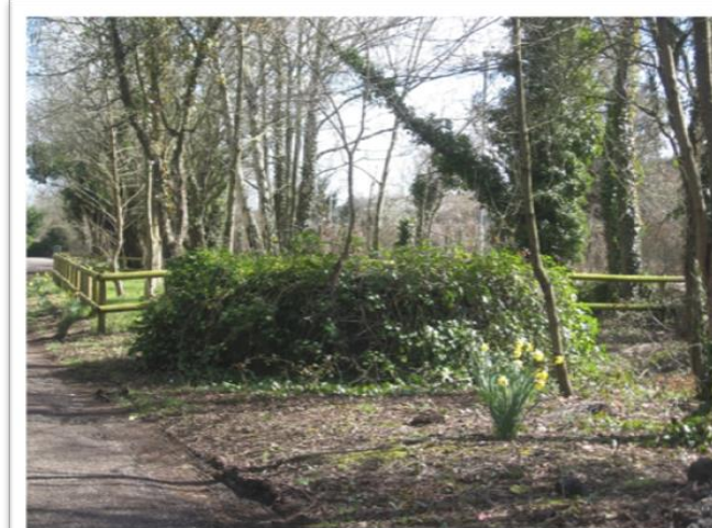
THE NOW IVY-COVERED BASE OF THE CRANE USED FOR UNLOADING