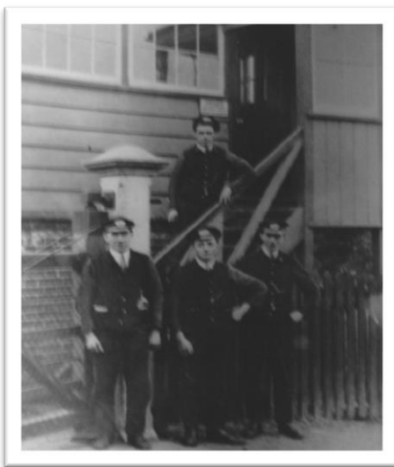
STAFF OF SIGNALBOX C 1918-20

dairy cows approached the crossing on its way to and from milking the signalsman would weigh up the time until the next train was due and, if he felt it necessary, close the level crossing gates early and keep the cows milling about outside them until the train had gone. The fact that there was always a signalsman awake and alert was very reassuring to villagers walking through the village at night, especially in the days before electricity when the village was very dark.