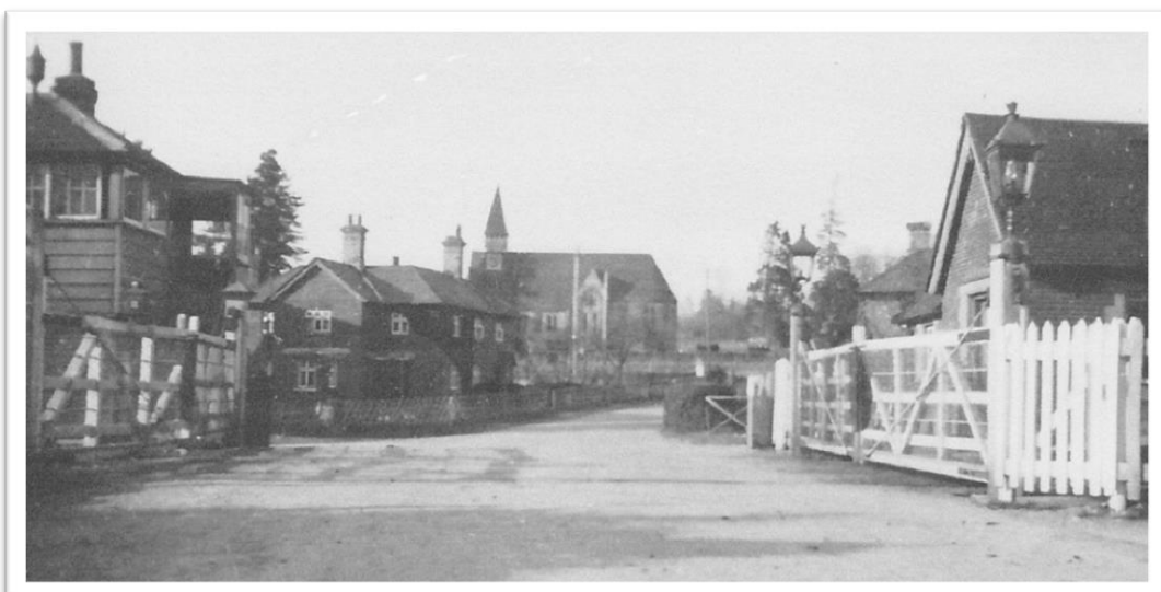
SIGNAL BOX AND LEVEL CROSSING 1962