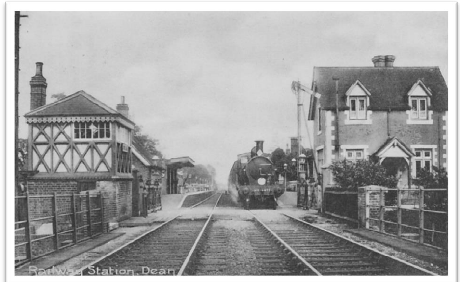
STAFF OF SIGNALBOX C 1918-20

It was manned 24 hours a day, 7 days a week by a team of signalmen most of whom lived in the Railway Cottages built for the purpose. In addition to operating the signals the signalmen opened and shut the level crossing gates, using a large wheel, and locked the pedestrian wicket gates as the train drew near. When a herd of