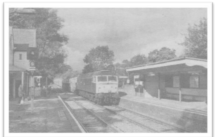
STATION WITH DIESEL ENGINE 1967

The Station was staffed and operating until 1984 when the decision was taken to close it and leave passengers thereafter to buy their tickets from the conductor on the train and to