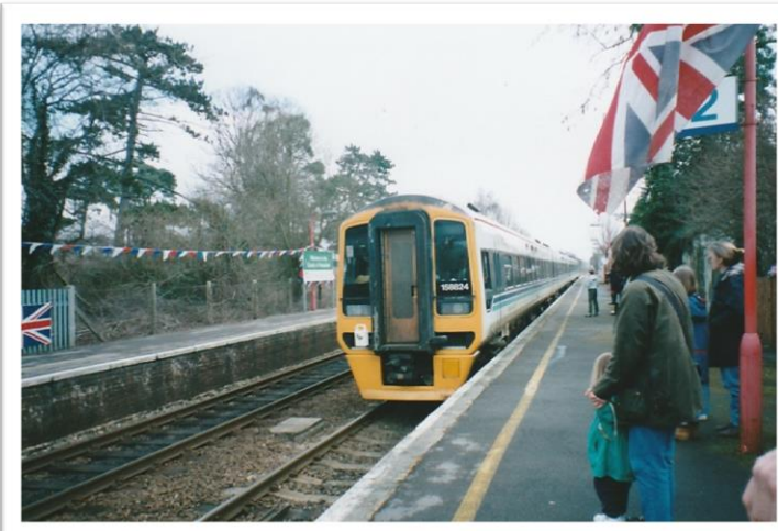
PERSONS IN VICTORIAN DRESS AWAITING COMMEMORATIVE TRAIN ARRIVING 1997