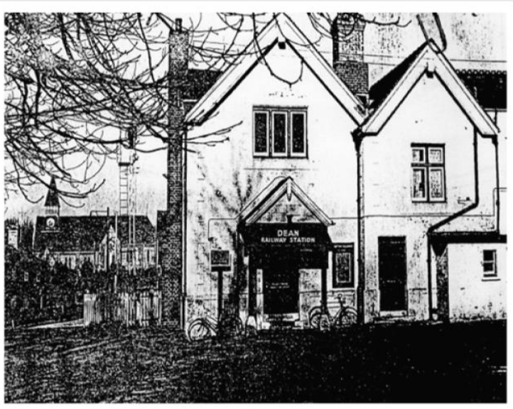
DEAN STATION IN 1968

The line from Bishopstoke (Eastleigh) through Chandler's Ford, Romsey, Dunbridge and Dean to Milford (Salisbury) opened for goods traffic on 27 January 1847. Passenger traffic began on 1 March 1847 and this is when the Station opened. The engine pulling these trains was a small steam locomotive called Firebrand.