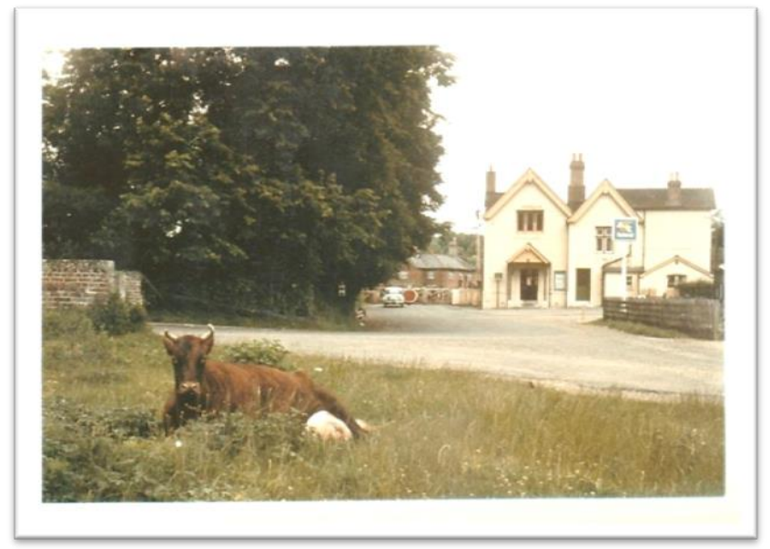
AFTER MORNING MILKING THE COWS WERE FREE TO DRINK FROM THE RIVER, GRAZE AND CHEW THE CUD ON THE GREEN UNTIL TAKEN BACK TO THEIR FIELD